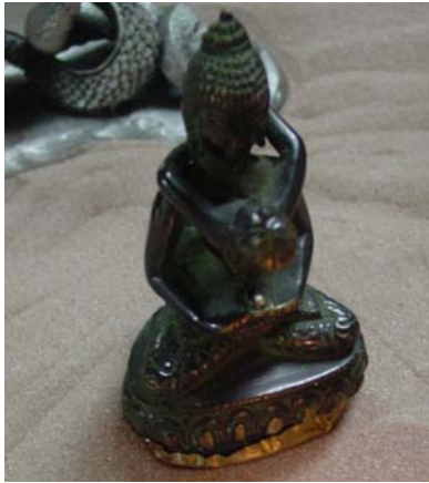
Color and sound make this man and woman.