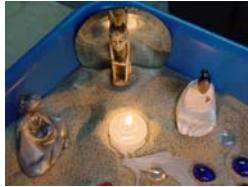
Here are the great Mothers.