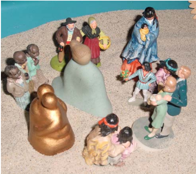
The mourners assemble. Grandson honors the dying grandmother with flowers. It is hard to say good-bye.

They have to do this. They can do this. The fairy sends them healing.