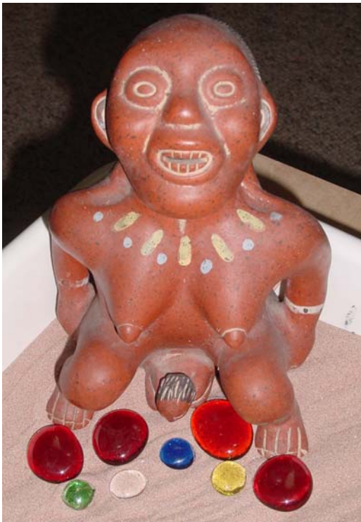
Blood flows. Our Great Mother births us from the Light.