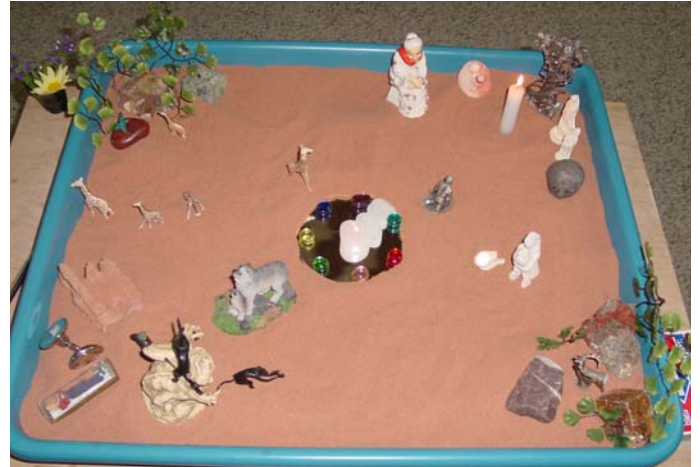
Time has been turned upside down ... innocence has died.

The Spirit Father teaches the child and the kneeling one. The great teachers of life are here. In the center is knowledge.