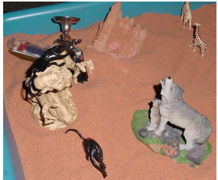
Evil and death have come into the World .... The wolves howl "stop!"

Evil and death are coming into the World. The demons are coming out.