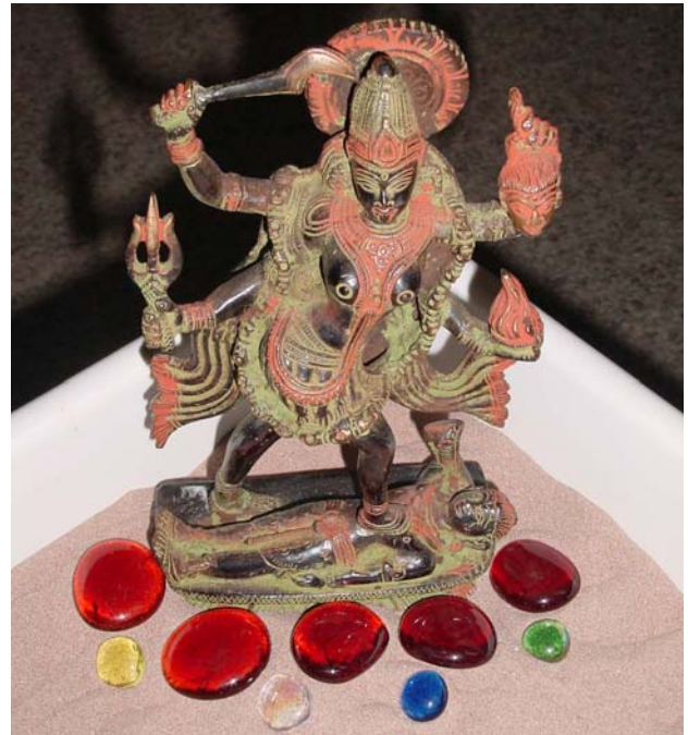
Great Mother Kali comes and sheds our blood. Killers and warriors serve her.

She and her sister Kali play with all of us. They are one.