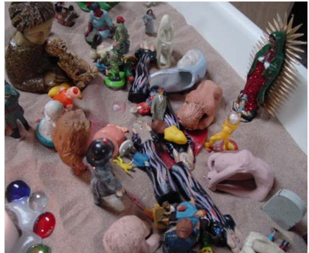
The death of so many ... such untold suffering It makes a difference

One marks issuance from the light ... birth ... The other marks return to the light ... death ... One marks increase and the other decrease ... On their level it makes little difference. In our human world it makes all the difference.