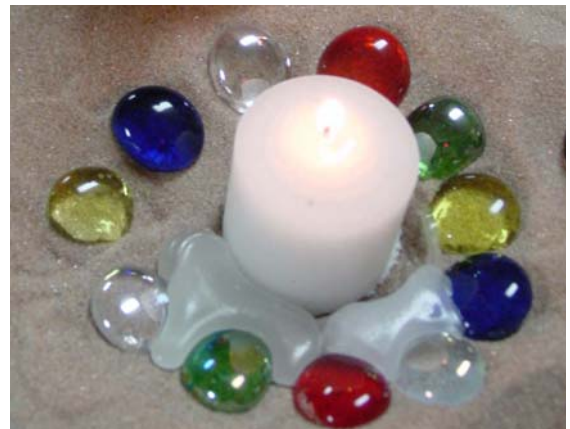
We begin and we end in the light at the center.