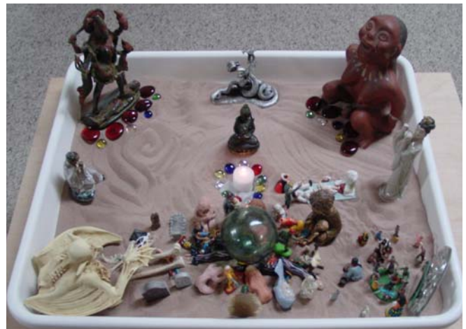
The eternal and the human are one rhythmic cycle of swirling sand around the light in the center.

It all begins with sand swirling and moving around the light in the center ... creating patterns in the sand ... In the beginning this central light is all there is.