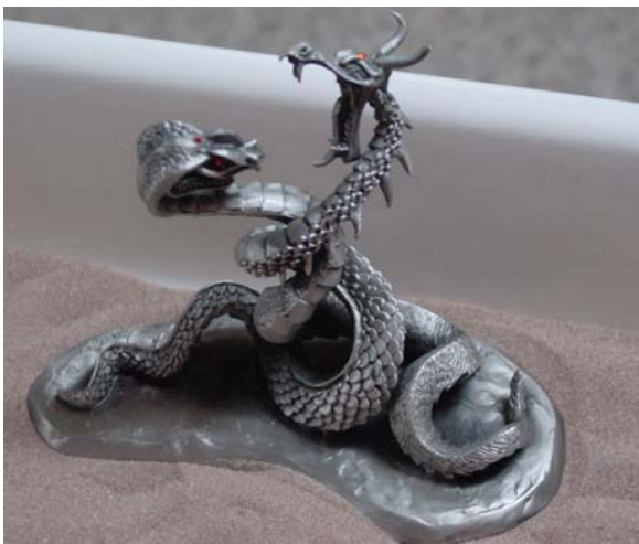
Our Freedom: Annihilation