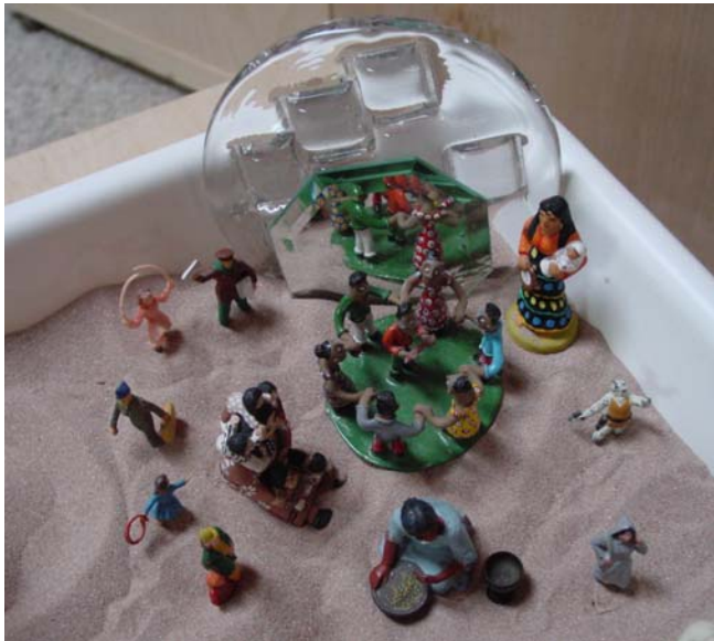
The peoples of the world

Everyone's reaction, no matter how great or small responds to some aspect of the truth of it all.