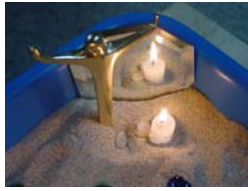
Here is the Christ with uplifted arms