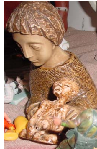
Holding the dying child

Yet, all have much in common ... We all play. We all dance. We all sing. We all tell stories. We all need food. We all need shelter. We all have children and families. We all do our work. We all love and fight. We come from long lineages of ancestors. We are here to share the earth. We are here to gift one another. We are all vulnerable. We all must die.