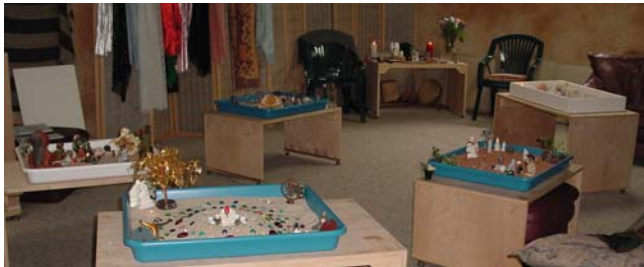
The five Worlds and the altar built on 9/11.

After we had looked at all the sandtrays, and had shared some of the stories hidden inside them, we knew that between us we had indeed opened our boundless hearts. We had embraced much of the essence of these events, which were shattering any notion that we were safe from the terrors of global violence. By each holding a significant part of this global event of terror, we had, in fact, constructed a sound communal foundation from which we could derive strength to continue learning more ways of integrating the complex reality of September 11, 2001 into our personal, professional, cultural and spiritual life.