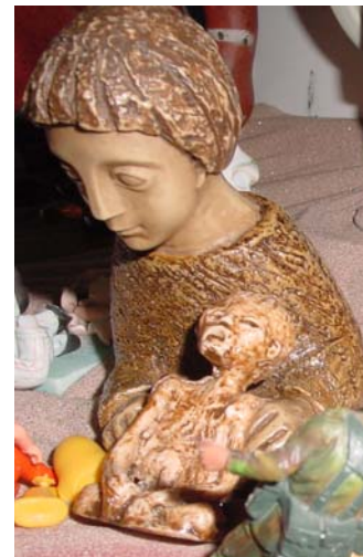
Holding the starving child

In the rubble He holds the burning, dying one. He is being humbled ... In this very moment he is taking something from the dying one ... it is a transfusion of understanding what was not known before... the knowing that life will never be the same and that no cause is big enough to justify humans inflicting such suffering on anyone.